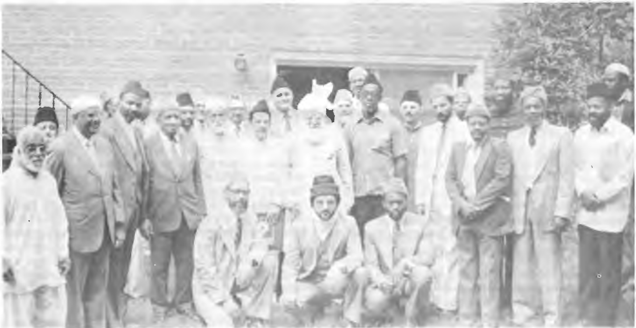
The Missionaries and the Presidents with Hazrat Khalifatul Masih III during his visit to Washington, D.C., in September, 1980