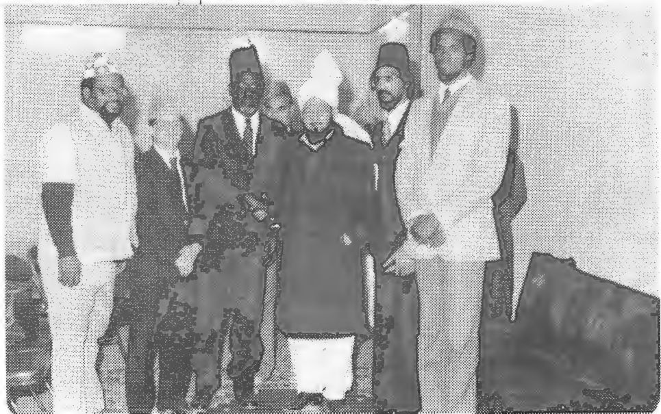
Some members of the U.S.A. Jamaat delegation to Jalsa Salana, in the company of Hazrat Khalifatul Masih IV, at Rabwah, Pakistan.