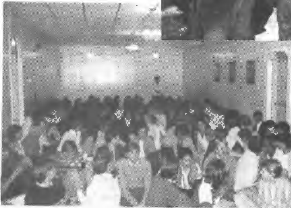
Sections of students sitting in the Ahmadiyya Mosque, York, PA, and listening attentively to the speakers.