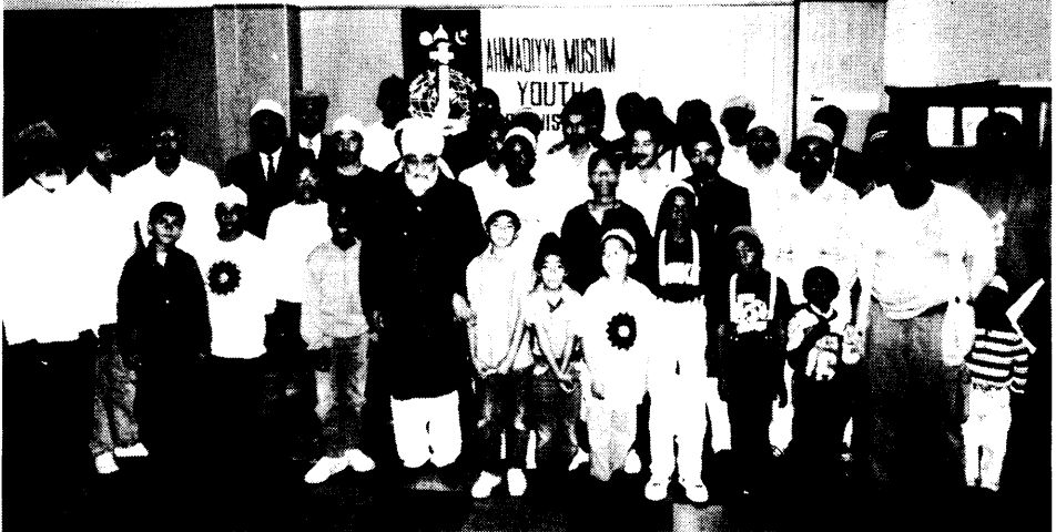
Amir & Missionary Incharge with Milwaukee Jamaat

Classes continue every Tuesday from 6-8 p.m. Lajna is currently reading and discussing prophecies about the advent of the Promised Messiah (a.s.). A non-