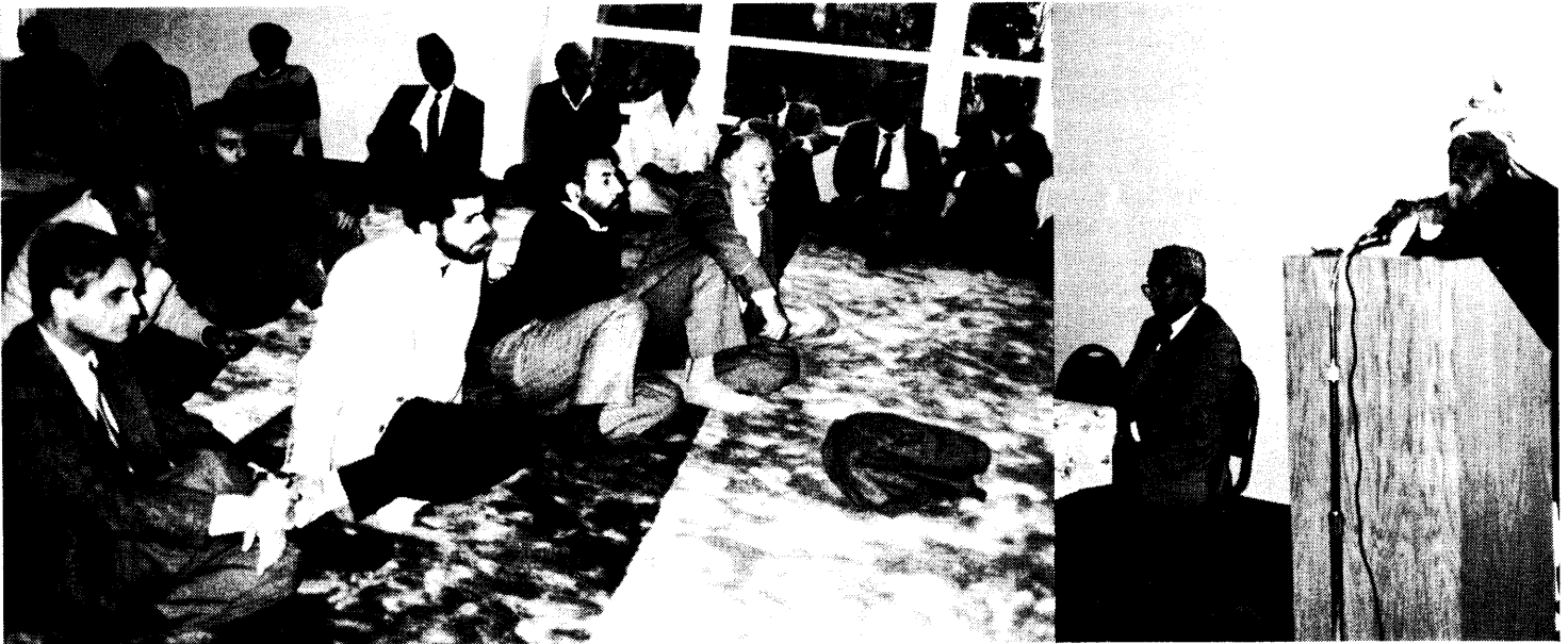
Jalsa Seeratun Nabi, Rizwan Mosque, Portland, Oregon.