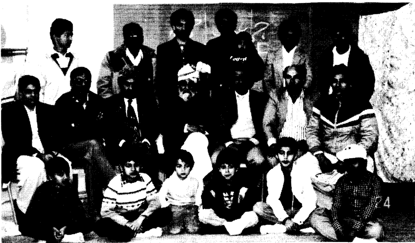
Amir & Missionary Incharge with Seattle Jamaat

BOSTON - General meeting of Jamaat Ahmadiyya Boston was held on Dec. 18, 1988. Our president urged members to make pledges for Tahrik-i-Jadid. He also urged them to write letters of appreciation to the Government of India for banning Salman Rushdie's recent novel.