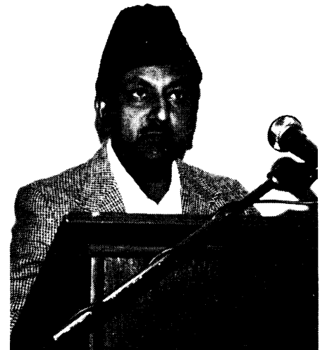
Jalsa Musleh Mauood, Washington, DC.