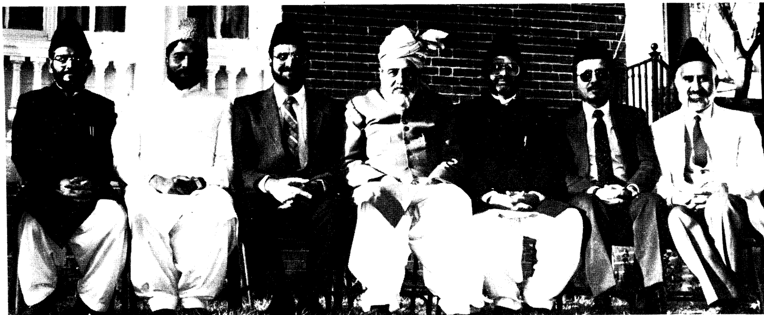
The Amir & Missionary Incharge with the missionaries working in the USA.