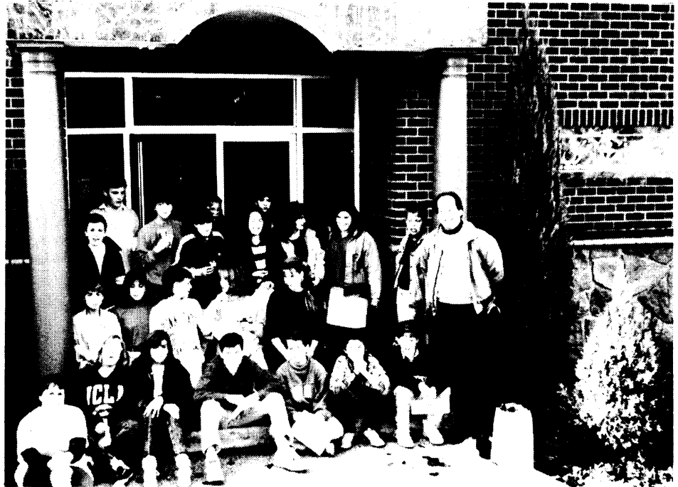
A group of seventh grade students with their teacher in front of Rizwan Mosque Portland.