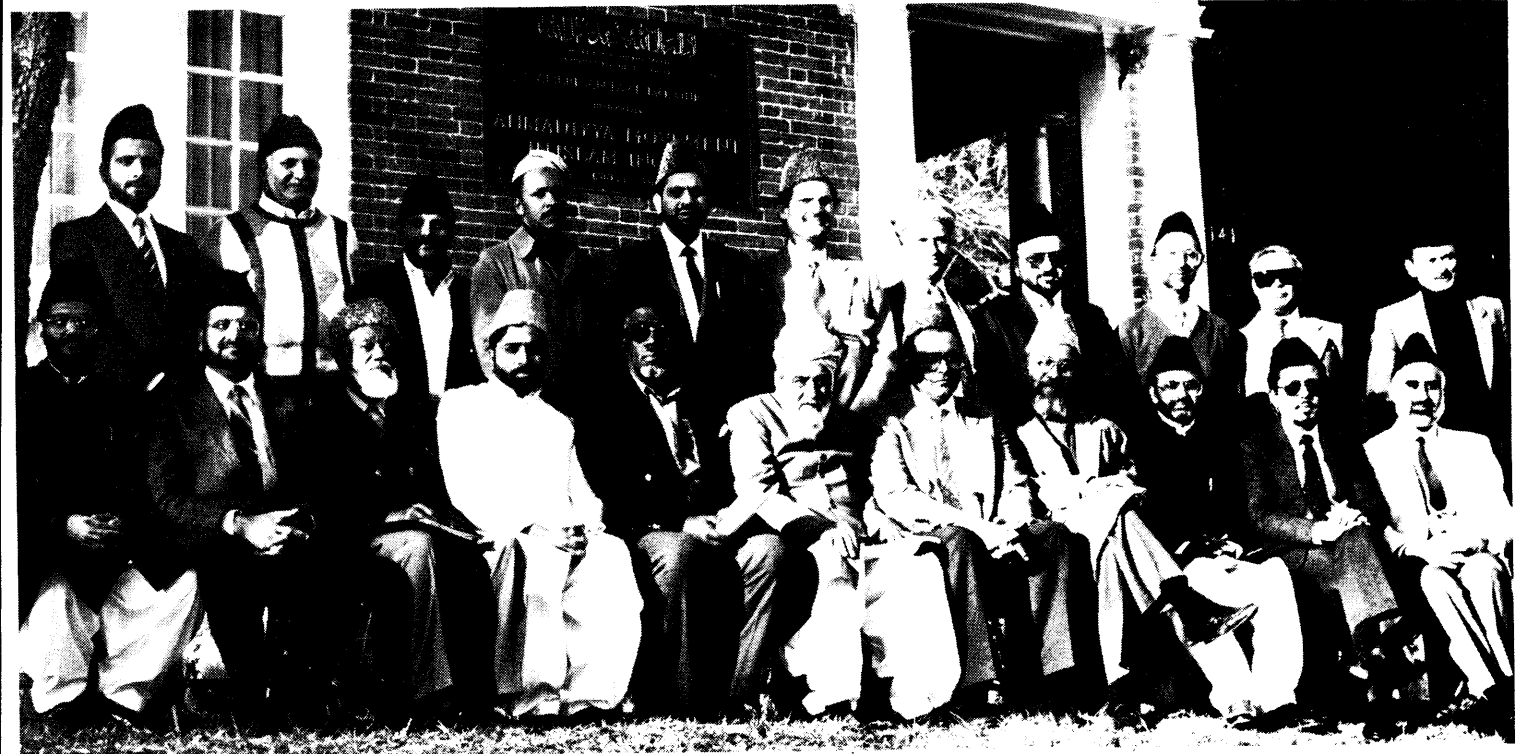
THE NATIONAL MAJLIS AAMILA, U.S.A.

Ahmadis say "Zia's "Islamization of Pakistan" and persecution of their sect