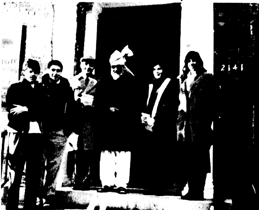
Amir & Missionary Incharge with students from North Carolina in front of the Fazl Mosque

In order to save the Muslims, Hazrat Aqdas said, we started this scheme out of Qadian and by the grace of God we have been able to gain success. Many mosques were restored and Call for prayers has started coming from them. Indian Jama'at cannot fight this battle alone and cannot provide the finances which are needed for this purpose. Therefore, all the money which is collected under Waqf-i-Jadid in the foreign countries is allocated for India. So far, some of the Jama-at have not fully realised the importance of this work and