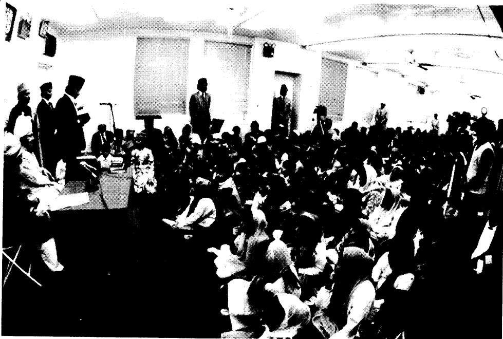
Huzoor addressing Tahir Class, Baitul Zafar, New York