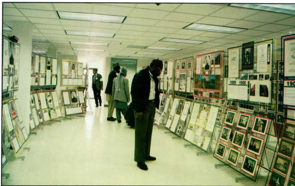
Few Guests from Bosnia and Exhibition Scene