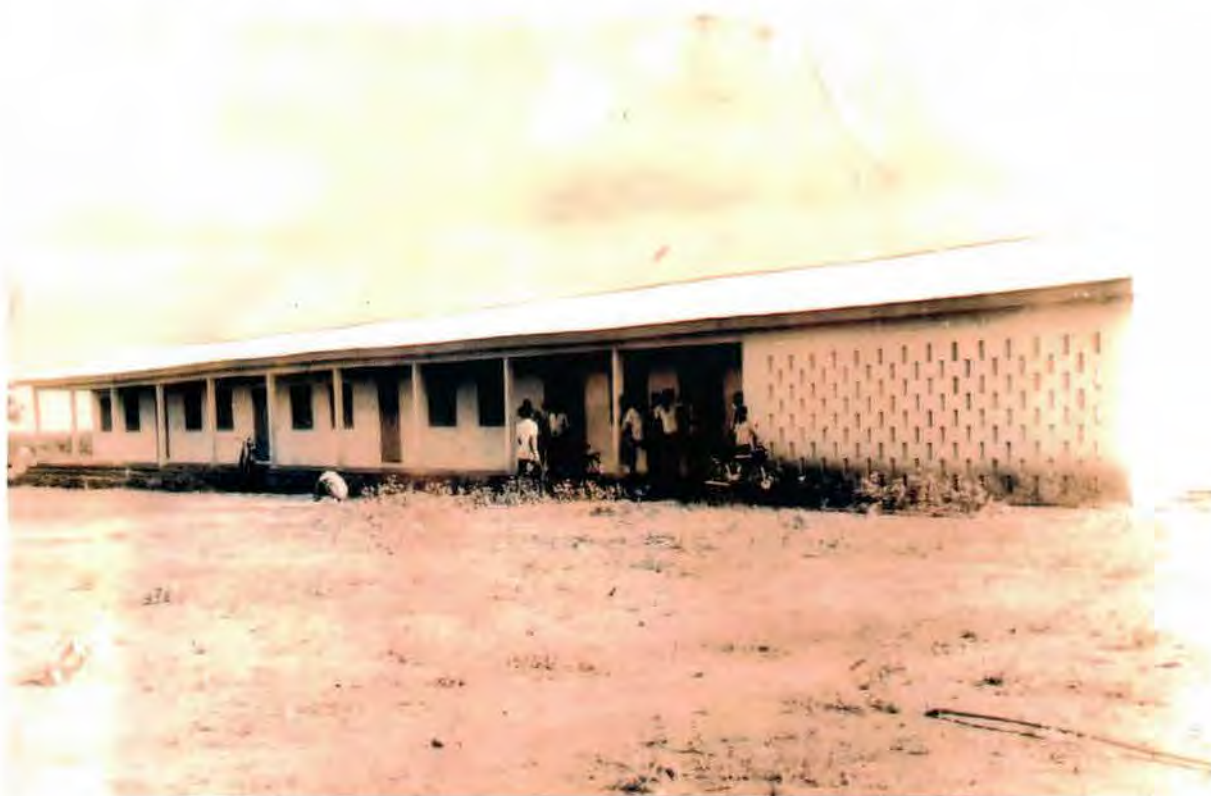
Ahmadiyya High School Salaga, Ghana Students are doing 'Waqar-e-Amal' (1975)