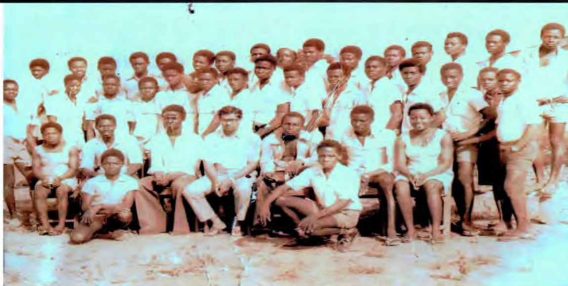
Ahmadiyya High School Salaga, Ghana First Class (8th Grade) With Principal and Staff (1975)