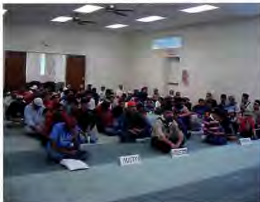
Khuddam and Atfal from various majalis in the Gulf Region of MKA