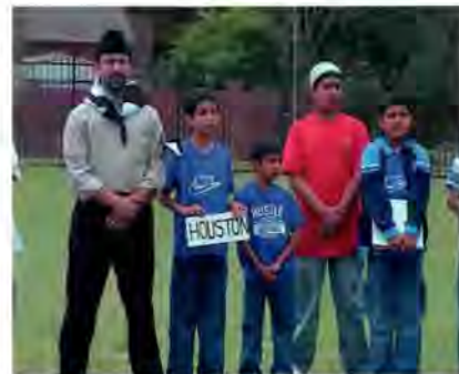
Members at MKA's Gulf Region Ijtema held in Dallas, April 15-16