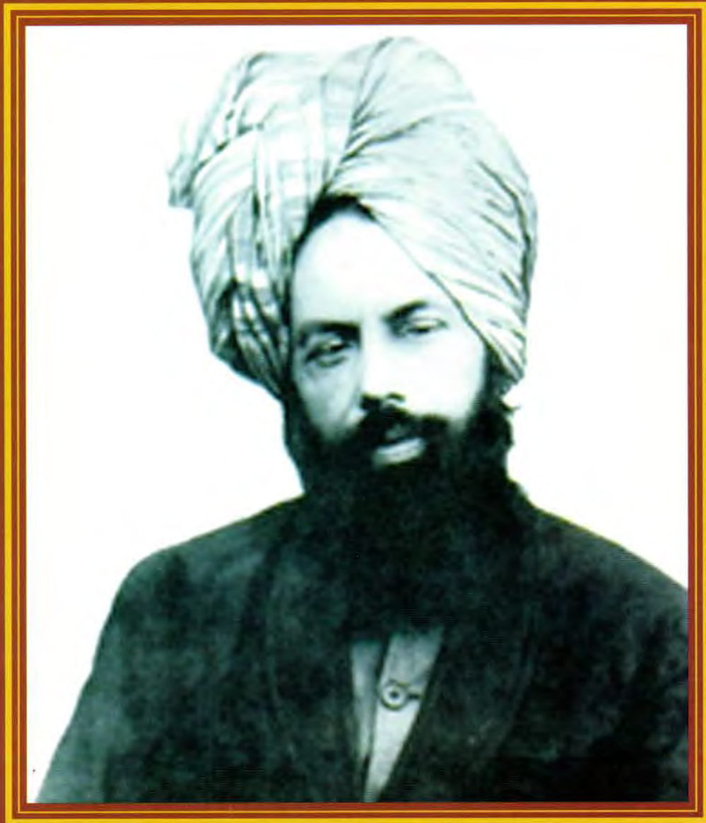
Hadhrat Masih Mau'ood (alaihis salam)